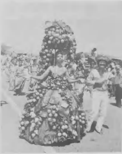
Queen of Carioca